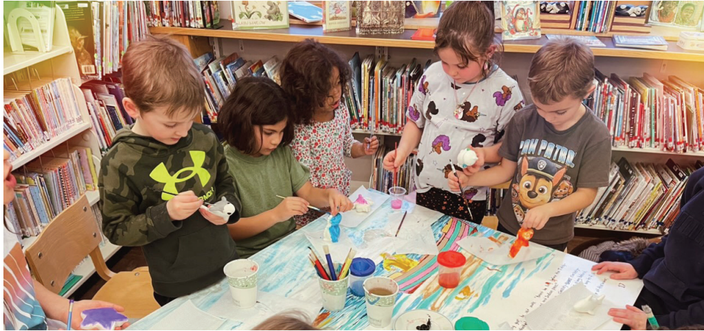
Younger group working on painting a mix of their clay art and stress toys.

The winter children's program at the library went splendidly! In early November through mid-April, we had two groups, grades K-4 and grades 5-8. Both met twice a month at the library and explored different themes and media. We used clay to make miniature foods, created our own stress toys, learned about abstract paper art, made fantasy maps, and more!